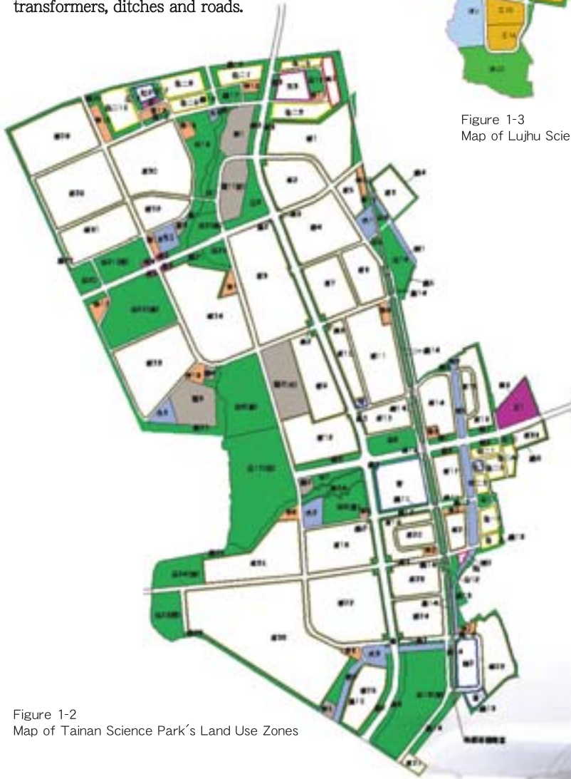
Figure 1-2 Map of Tainan Science Park's Land Use Zones

Lujhu Science Park encompasses an area of 1,408 acres. Land use planning incorporates the industrial zone, management & commercial service zones, residential community zone, service facility zone and preservation zone.