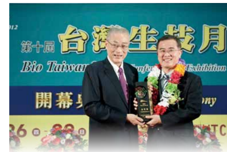
■ The "2012 Golden Award for Outstanding Biotech Enterprise" Given by the Vice President of the R.O.C., Mr. Wu Denyi to ScinoPharm Taiwan (July 26, 2012)