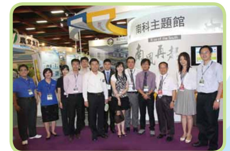
■ Representatives of STSP Park Enterprises at Bio Taiwan (July 26, 2012)