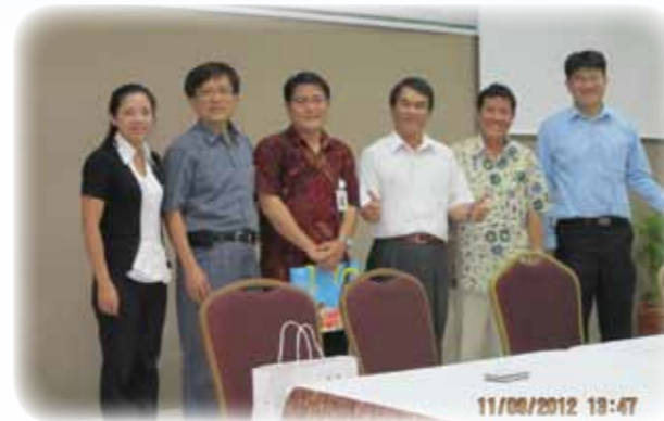
■ Visit to Eka Hospital by the STSP Delegation (November 8, 2012)

to link to International Standards" with the aim of fully integrating industrial, government, academia, research, and medical resources to promote the R&D efforts of the biomedical industry.