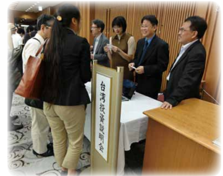
■ Warm Interactions on the Site of the Seminar and Consultation Meeting for "Investment in Taiwan" at Tokyo Keidanren (July 11, 2012)

To enhance cooperative advantages between Taiwan and Japan, the STSP Administration intends to recruit more Japanese investors to the STSP. During the "2012 Promotion Delegation for Investment and Industrial Cooperation to Japan," organized by the MOEA, the STSP Administration began a series of investment recruitment activities from July 8 to 13 in Japan. Besides general investment recruitment visits, the STSP Administration proactively contacted international manufacturing leaders such as Hitachi, Dai Nippon Printing Co., Ltd., Sumitomo, JX NIKKO METALS, and Nidec Corporation. On July 11 and 12, seminars and consultation meetings on "Investment in Taiwan" were convened in Tokyo and Osaka and filled to capacity. The exceptional investment environment of the STSP impressed the audience and earned much positive feedback.