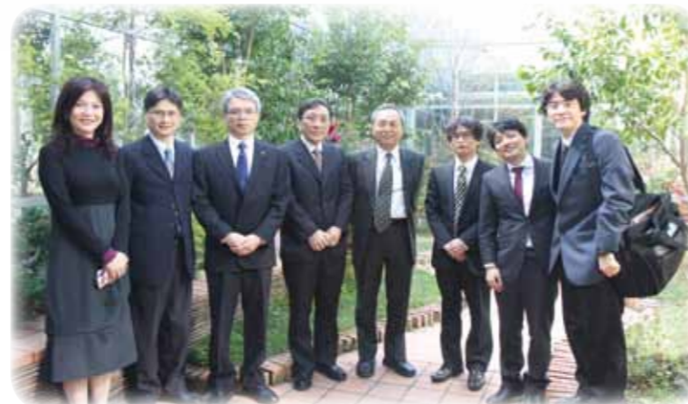
■ Visit of the KFIS to the STSP (January 17, 2012)

Conference (IASP) was held from June 17 to 20 in Tallinn, Estonia. During the conference, the paper entitled "The Study of the Relationship between Southern Taiwan Science Park and Regional Innovation Network" was presented to share the implementation of the STSP Administration biomedical device program and the facilitation of professional education efforts and research result exchanges as well as the commercialization of research results with the attendees. The STSP representatives also, during the conference, actively visited local medical device makers to exchange and learn in order to lay a more solid foundation for the future development of the biomedical device industry at the STSP.