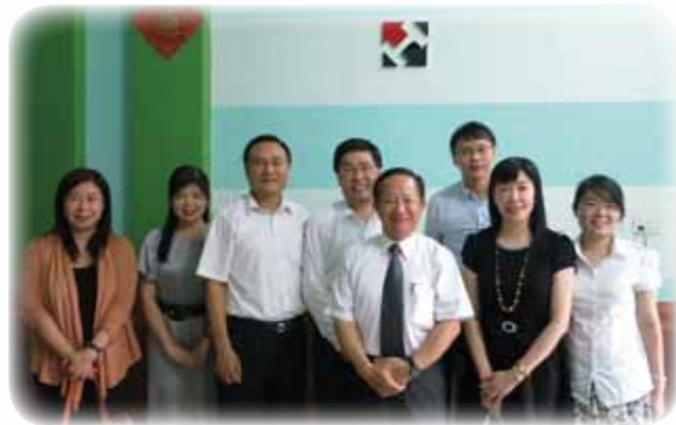
■ STSP Administration Delegation's Visit to THUY AN Company (October 26, 2012)