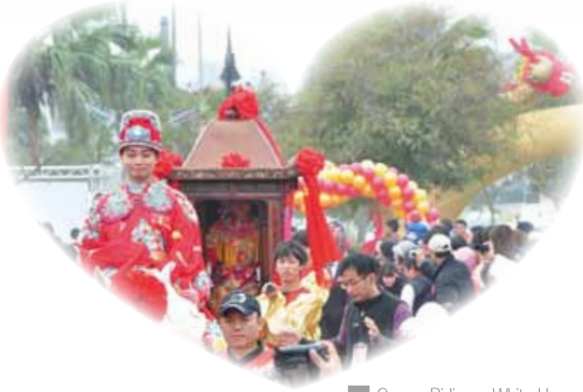
Groom Riding a White Horse at the Traditional Chinese Wedding Ceremony (February 12, 2012)

The 13th STSP Neighborhood Cup and Fun Contest was held from June to September. There are four types of ball and fun games that attracted the participation of 190 teams. The TSMC team was the winner of both table tennis and basketball among the STSP group. The closing ceremony was held at the Leader Wellness Center STSP on September 15. The STSP Neighborhood Cup and Fun Contest has