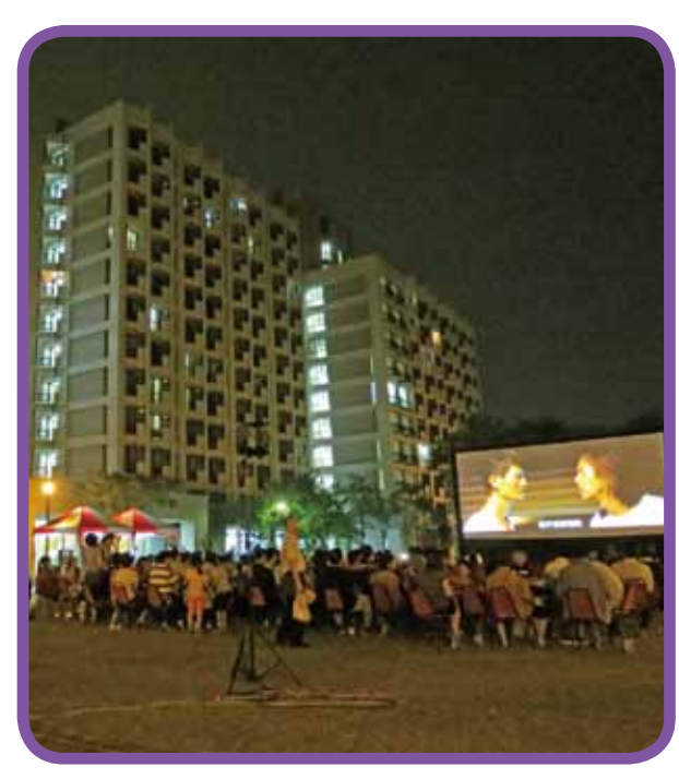
The Activity Site of Outdoor Cinema outside the Dormitory Area of the Kaohsiung Science Park (September 19, 2012)

On September 19, the "2012 Kaohsiung Science Park Outdoor Cinema" was held in the grassy area of the Kaohsiung Science Park dormitory where the wonderful film, "Din Tao: The Leader of the Parade" was presented with tasty snack food that was provided to satisfy the viewers with fun and gourmet food.