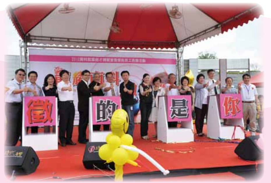
Opening Ceremony of the 2012 STSP Career Fair and Outstanding Labor Awards (April 29, 2012)