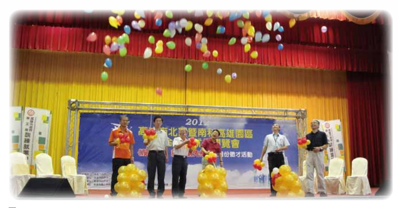
Opening Ceremony of the 2012 Northern Kaohsiung and the Kaohsiung Science Park Joint Career Fair" (August 04, 2012)