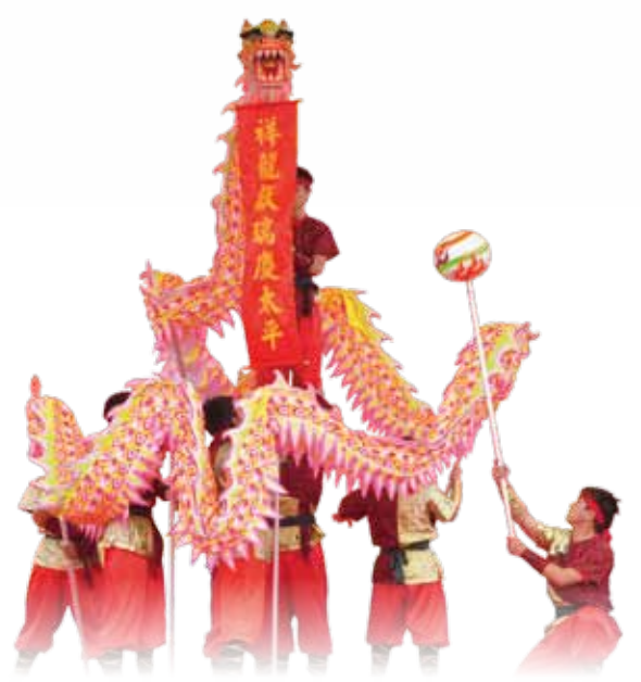
Dragon Dance Celebration at the 9<sup>th</sup> Anniversary of the STSP Administration