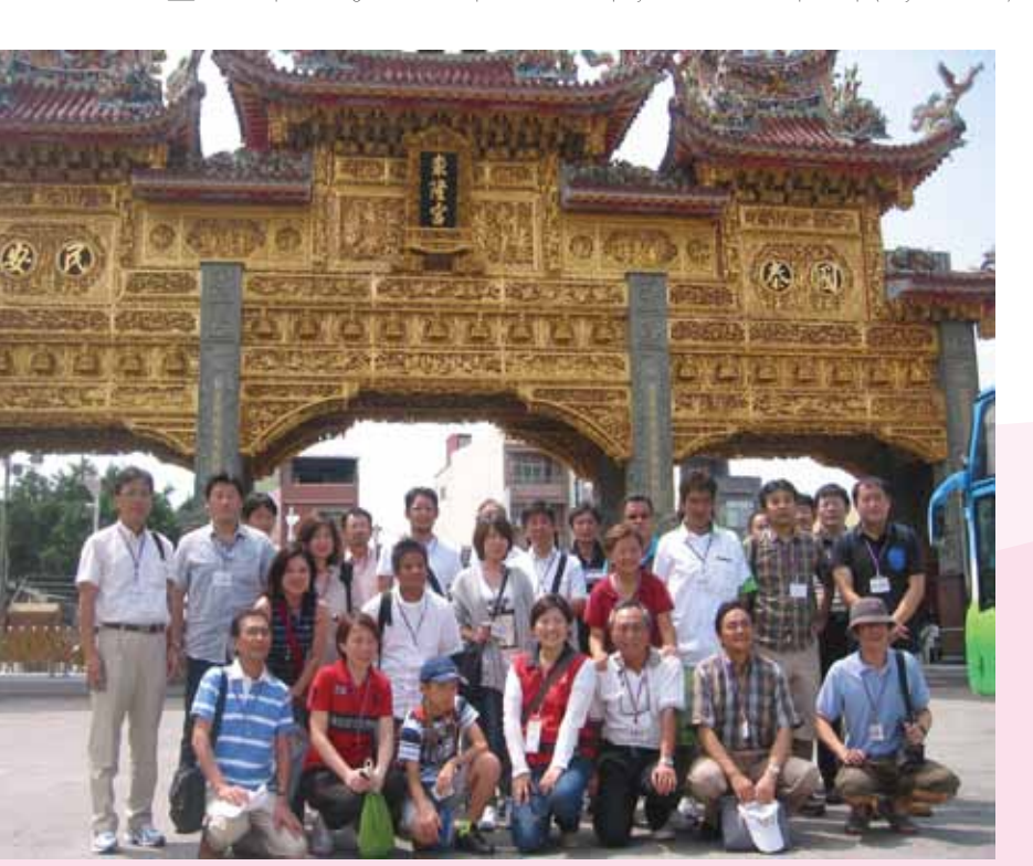
Japanese Park Employees in front of Characteristic Hakka Traditional Structure in Pingtung (September 1, 2012)