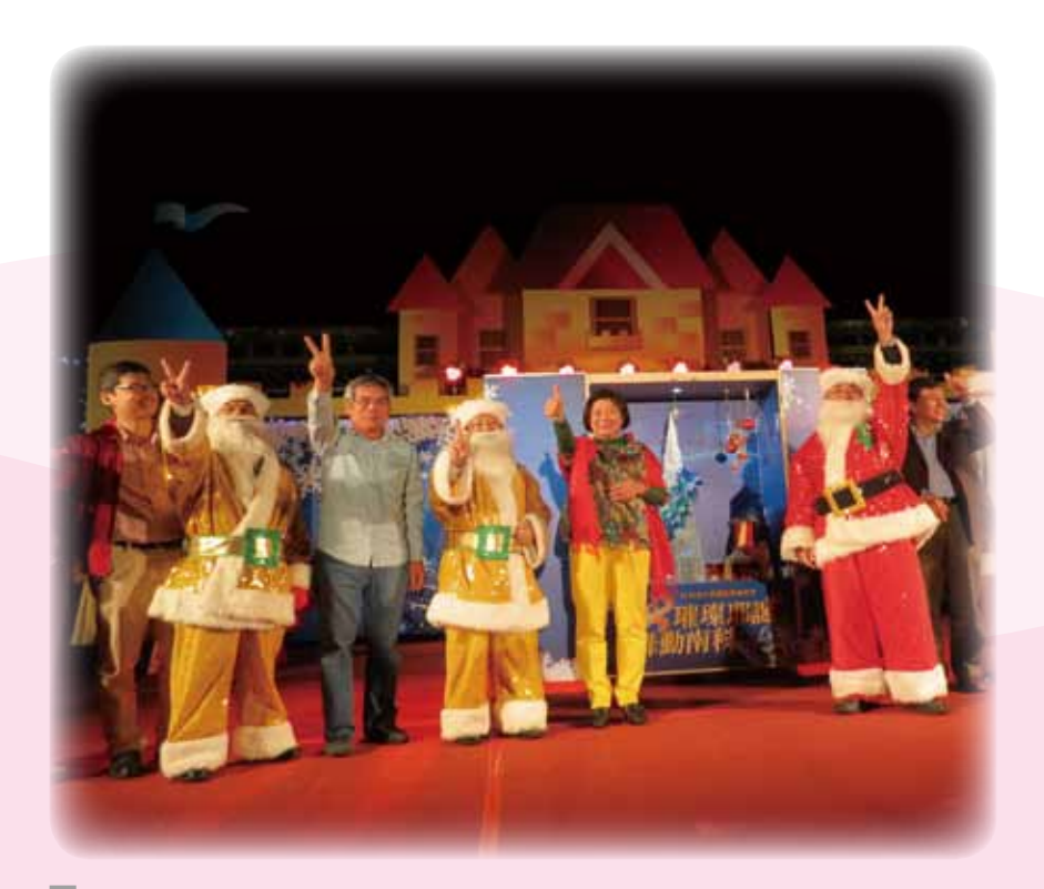
Fairy Tale Atmosphere during the Christmas Evening Celebration (December 22, 2012)