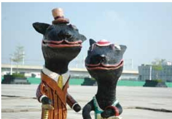
▲ Humor in Life, a Presentation of Humorous and Fun Little Moments (Public Art at Tainan Science Park)