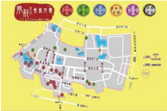
▲ Culture and Art Map Website of the STSP