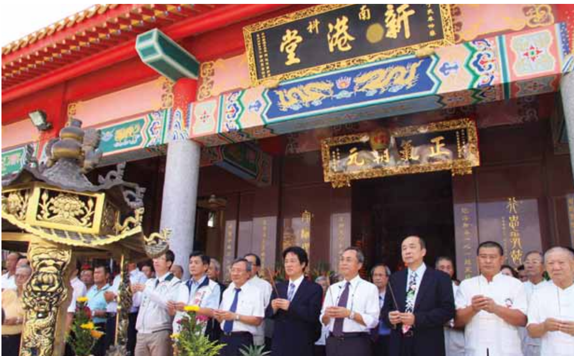
▲ Blessing Ceremony with Many Distinguished Guests at the Fifth Anniversary of Xingang Temple (September 16, 2011)