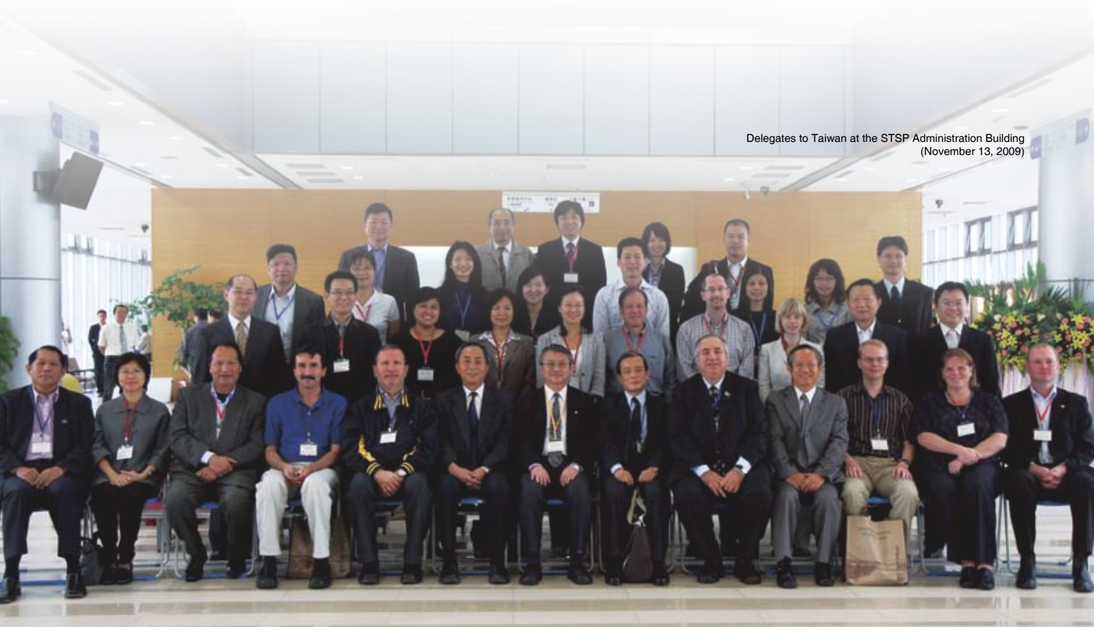
Delegates to Taiwan at the STSP Administration Building (November 13, 2009)