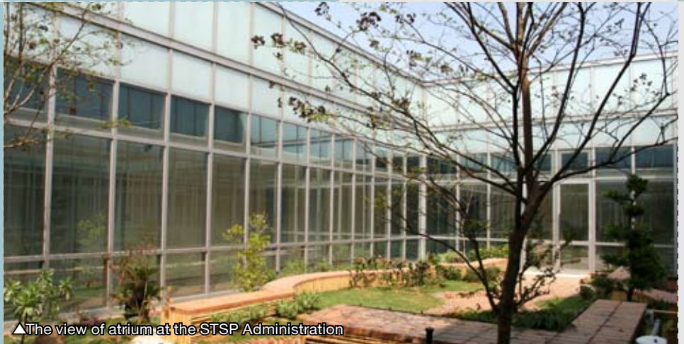
▲The view of atrium at the STSP Administration