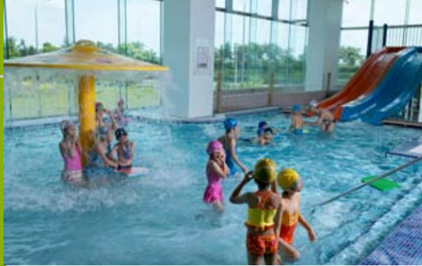
▲ Indoor heated swimming pool in Wellness Center