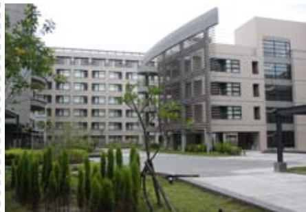
▲ The Phase III single dormitory in TSP is an excellent place to live.

to the public in May 2008. The park is designed with a “classical South Min (Fujian) garden” theme and portrays the ideal lake view of Tainan Min-style garden. The recreational park, brimming with local culture, wins the attention of many visitors.