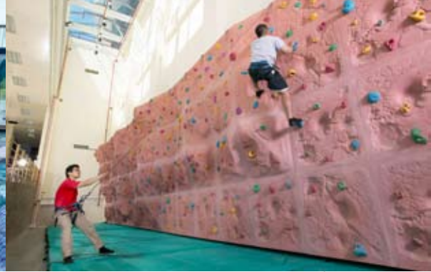
▲ Indoor rock climbing walls in Wellness Center