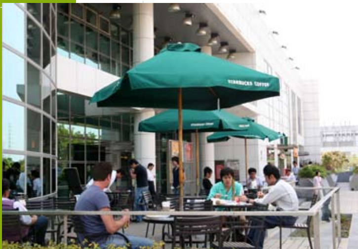
▲ Park 17 Life Style Center attracts customers with its excellent service.

The Center is the first OT (operate and transfer) project in Science Parks involving