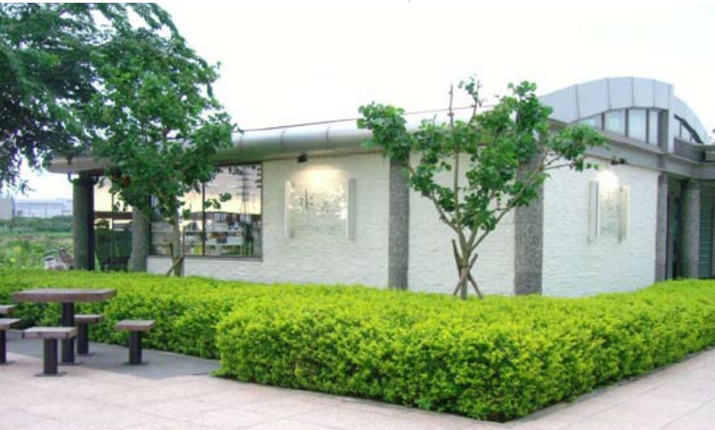
▲ With a taste of Mediterranean, Yingsi Lakeside Waterfront Café

a private sector. It is planned and operated by Leader Hotel Business Group and popular with the Park staff.