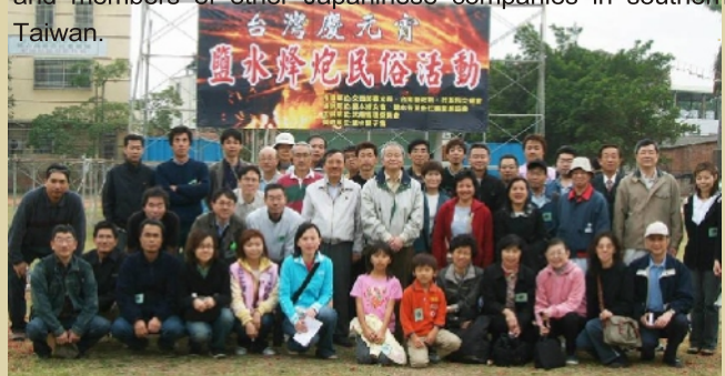
Japanese Employees joined the Yanshui Beehive Firecracker Festival. (February 12)

On July 21, 2006 "Awaodori Dance Night: Cultural Exchanges between Taiwan and Japan" was held on the ground floor of the STSP Administration Office. Awaodori dance is a folk dance from Japan. Participants included the CEOs and Japanese employees of Chi Mei Optoelectronics, Sumika, Lintec, International Nitto, Kenmos, Taiwan West Electric, Finex, Taiwan Stanley Electric, and Taiwan Daifuku, and members of other Japaninese companies in southern