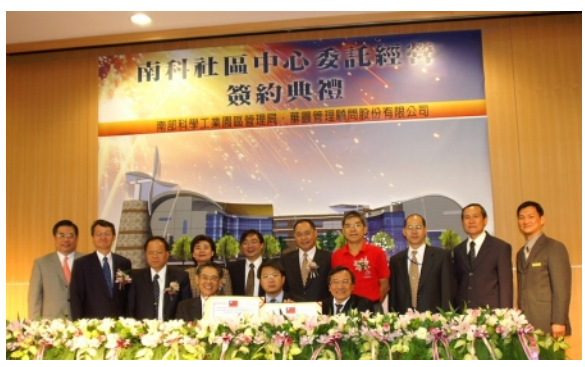
A group photo was taken while signing the "Private Participation in Infrastructure Projects" contract for the operation of the STSP Community Center (February 16)

Healthy, tasty and convenient, Semeur de Pain now serves all employees in the STSP. The bakery opened on October 18, 2006 to provide great food for TSP employees as well as for visitors who come to the Tainan Science Park for commercial meetings.