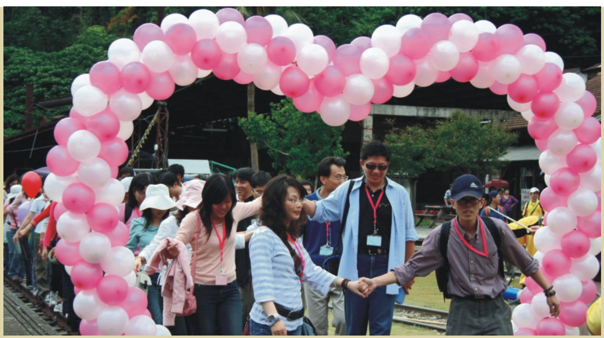
Participants in the matchmaking activity walked hand in hand on the railway tracks in Checheng. (November 4-5)