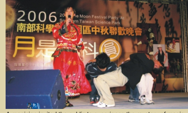
A magician invited the public to experience the mystery of magic firsthand. (October 4)

"Wake up to Jazz in an Autumn Day" was held on the