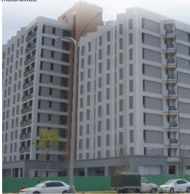
The First-phase Employee Dormitory in the KSP

There are 590 units in the single dormitory (including 301 single rooms and 289 twin rooms), 48 units in the family dormitory (122 square meters each) and 12 units in the VIP dormitory (188 square meters each). The three buildings are independent from each other. Each building is 12 stories with a basement for each. The basements of the three buildings are connected and accommodate 381 cars and 413 motorbikes.