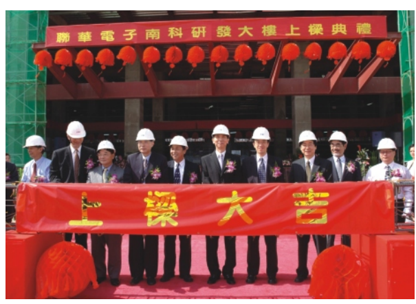
The Girder Placing Ceremony of the STSP Research and Development Building of the UMC (November 16)

The KSP also showed its determination in innovative research and development. On November 6, 2006, the Research and Development Foundation of National Cheng Kung University, the winner of the outsourcing project of the "Industrial-Academic Innovation Center", formally operated in KSP. The goal of the Industrial-Academic Innovation Center is to become a regional center of technology exchange, develop various projects by integrating resources from government, universities and research institutions as well as cultivating promising employees. A joint grand opening ceremony of STSP Administration's KSP Office, Industrial-Academic Innovation Center, Digital Family and Digital TV Validation Lab of the Industrial Technology Research Institute (ITRI) and FTTx+PLC Broadband Service Demonstration Project was held on November 14, 2006.