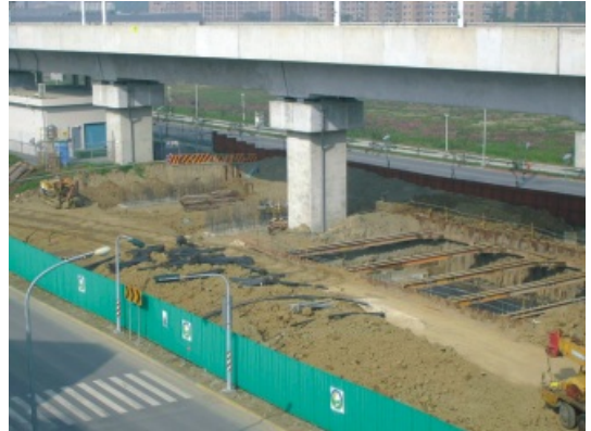
Construction of Foundation Reinforcement