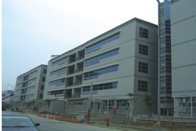
Residential Area in the Northern Side and East 1 and 2 Area Development Project (Roads of East 2 Area )